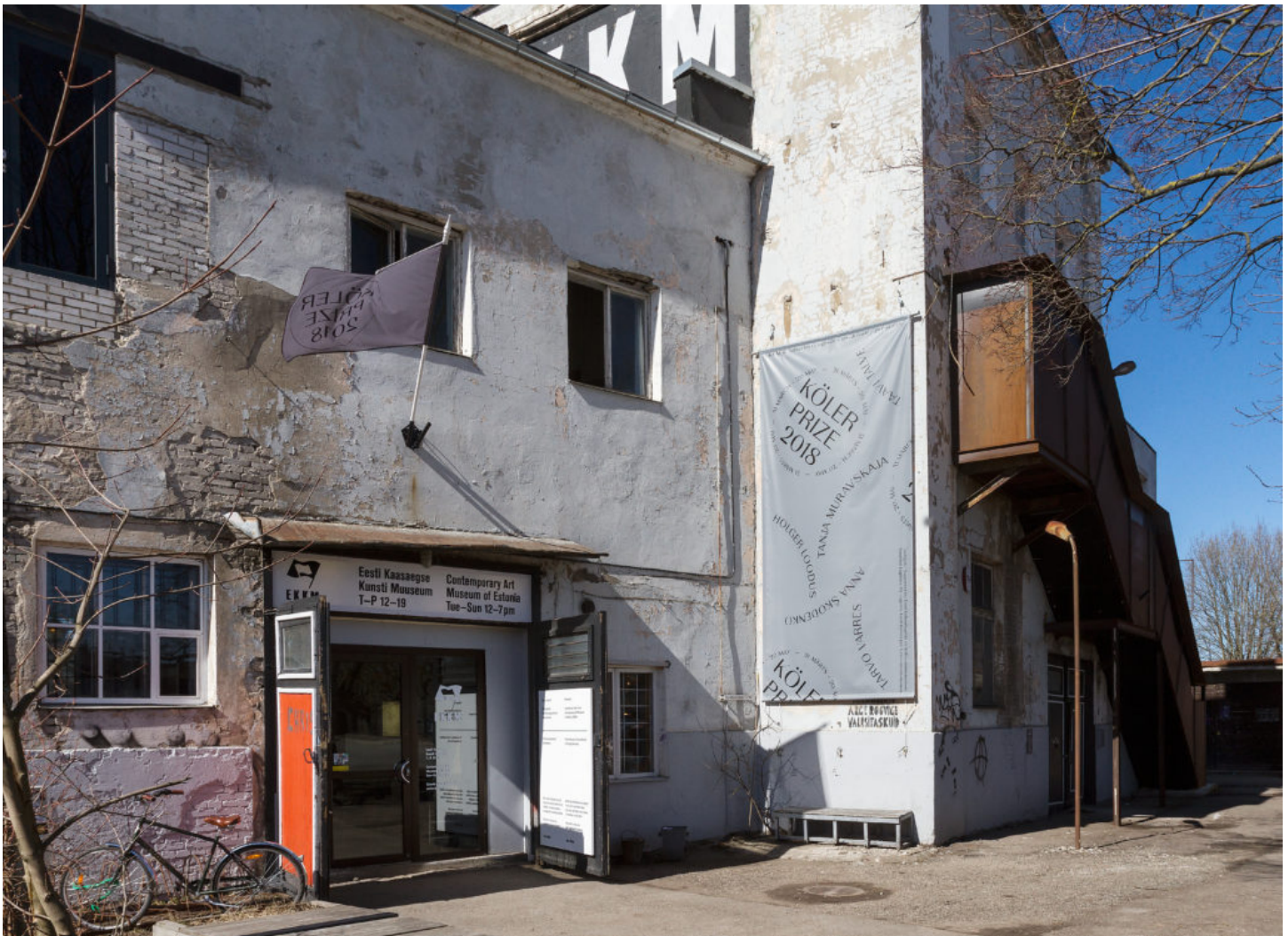
Contemporary Art Museum of Estonia (EKKM).

Below, we survey the rules the Estonian art scene has made for itself—and what the rest of the world can learn from them.