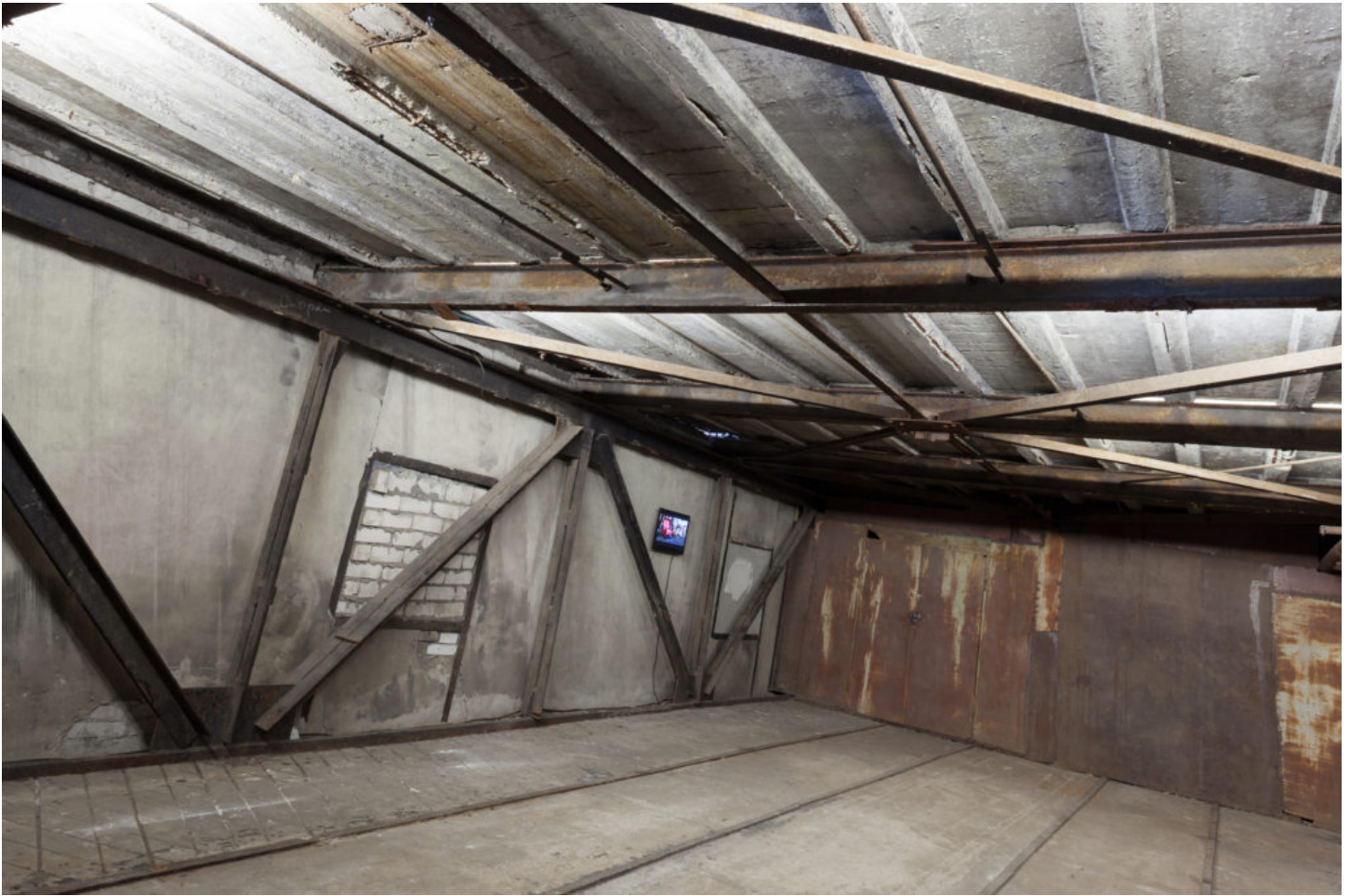
Interior of EKKM, in the former elevator shaft that is now used as a (disorienting) exhibition space.