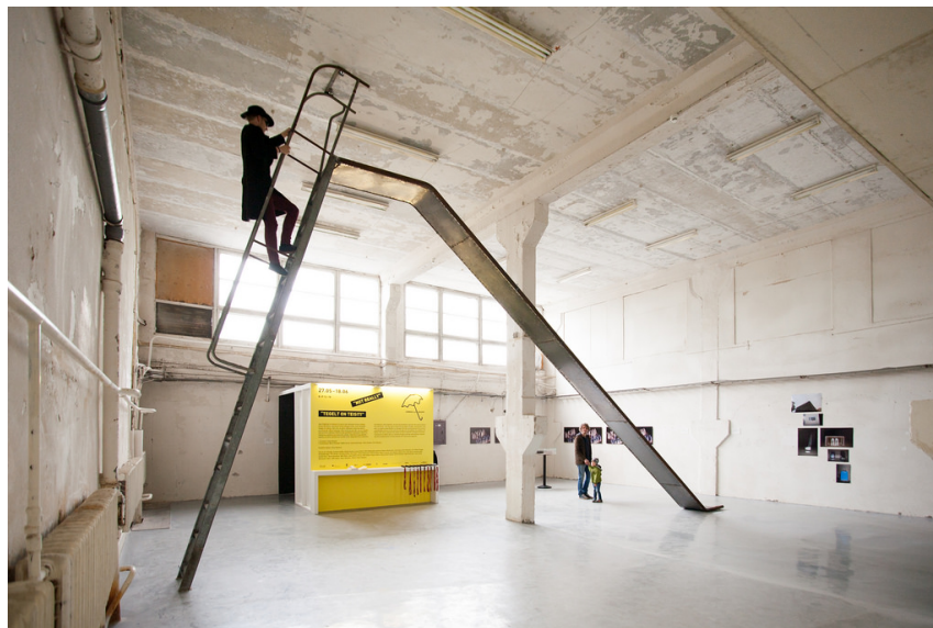
ARS Project Space in ARS Art Factory in Tallinn, which is run by the Artists' Association. Exhibition "Not Really" by Umbrella Group.