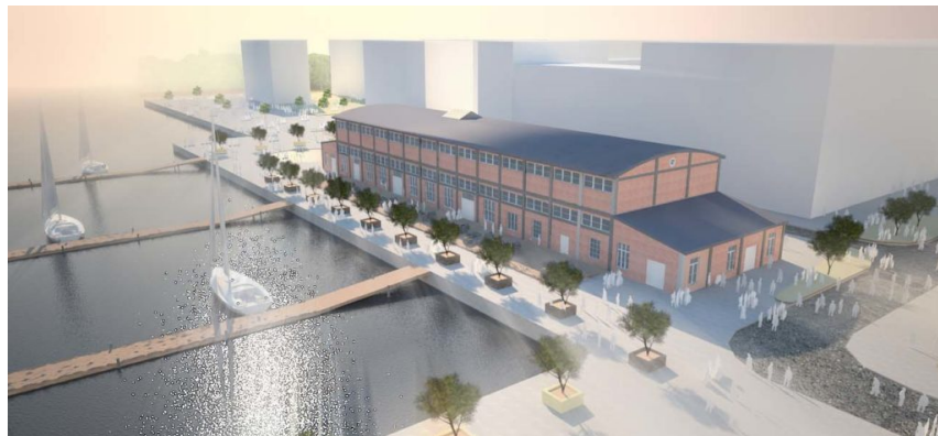
Mock-up for the Estonian Contemporary Art Development Center.