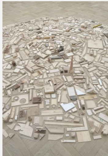
"The Art of Being Good" Exhibition at the Tallinn Art Hall