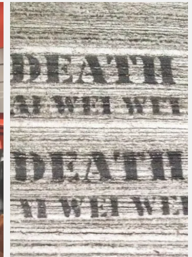
Off The Wall Art